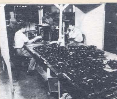
Final inspection of the complete instrument is as thorough as the first raw material tests that are made in the extensive Kellogg Laboratory.