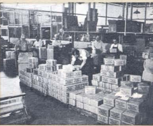
Soon these Masterphones will be providing dependable, trouble-free low cost service in thousands of homes and offices throughout the country.

Modern industry recognizes through long experience that efficiency is the most vital factor in gaining and holding customer satisfaction. Kellogg efficiency has been typically reflected in the production of the 1000 Series Masterphone. The Masterphone is the pacesetter for continued high instrument standards, having behind it the skills and foresight which fifty years of service and progress can not but help to bring. If it's the best you want, you want the Masterphone.