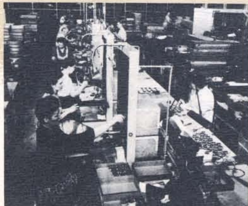
The receiver, most sensitive component of the Masterphone handset, includes 22 parts—some so delicate that they are assembled under a magnifying glass.