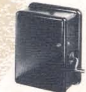
Hand Generator Boxes No. 1203 3-Bar. No. 1205 5-Bar. No. 1206 6-Bar.