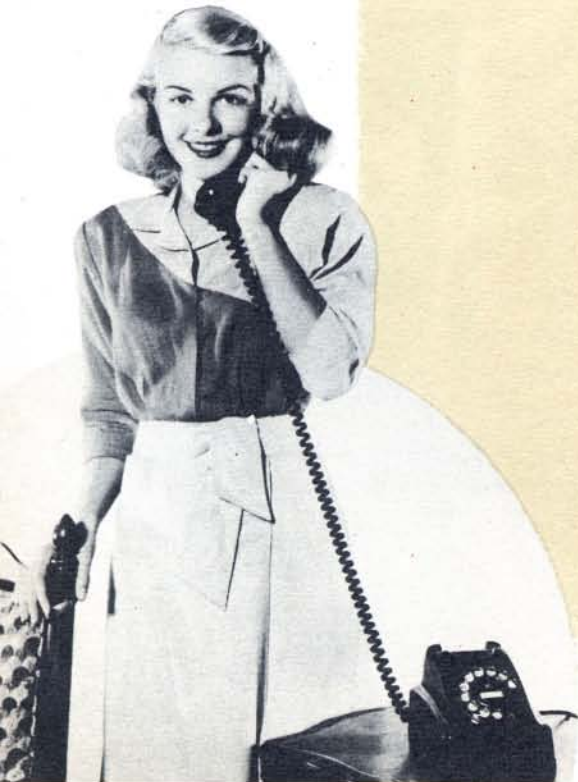
Barbara Bates appearing in the Hal Roach Cinecolor feature comedy "The Fabulous Joe."