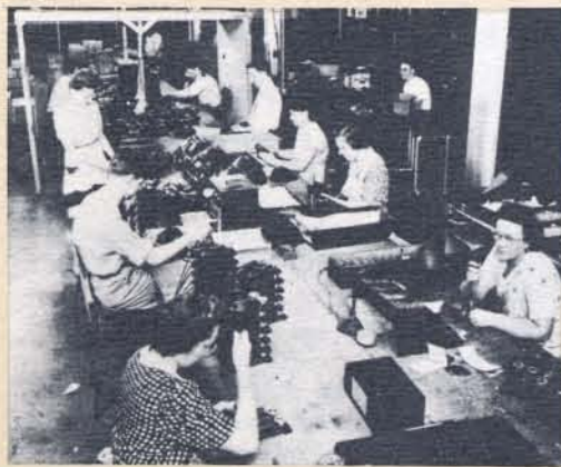
Here the interconnecting blocks and ringers are mounted to the base plates and the potted condensers and induction coils are plugged into the interconnecting block.